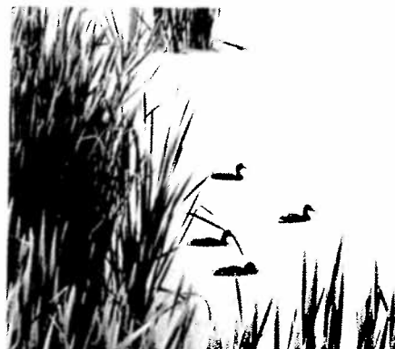
From the inlet pool (left) water flows through a long, shallow channel dense with cattails before reaching the first deep pond. In the deep, slow moving waters of the pond (right) a film of duckweed floats on the surface in summer.